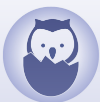
FELLOWS Early Career